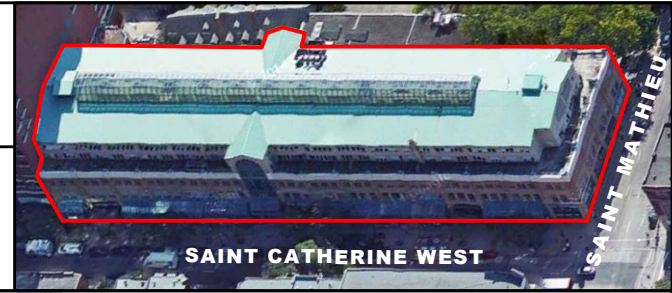
SAINT CATHERINE WEST