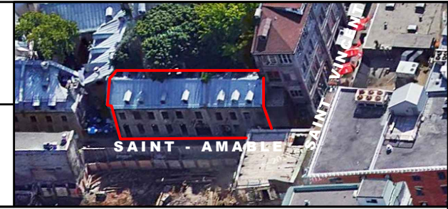
SAINT - AMABLE